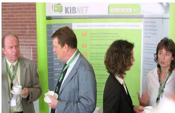
Smalltalk at the KIBNET-Stand

About 150 acknowledged experts from the EU, from national government authorities, higher-education institutions, big IT companies and other stakeholders, including unions, were registered as attendees. KIBNET informed participants with print material and conversations about continuing vocational IT education and training in Germany. Questions about this subject were immediately answered in appropriate detail in a large number of one-on-one discussions. We encountered great interest and a number of new promising contacts were made.